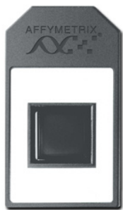
Affymetrix Gene Chip

In the past it was only possible to check the activity of a few genes. Genome chip and microarray technology now allows us to study the activity of large numbers of genes simultaneously or even the entire genome!