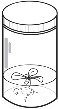
Plant A (Control)